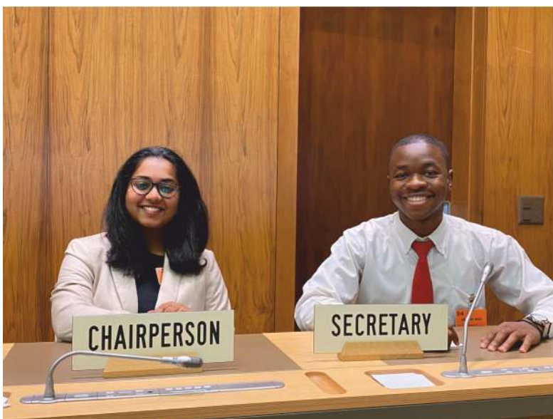
WTI students enjoying their annual WTO Moot Court simulation at the WTO building in Geneva