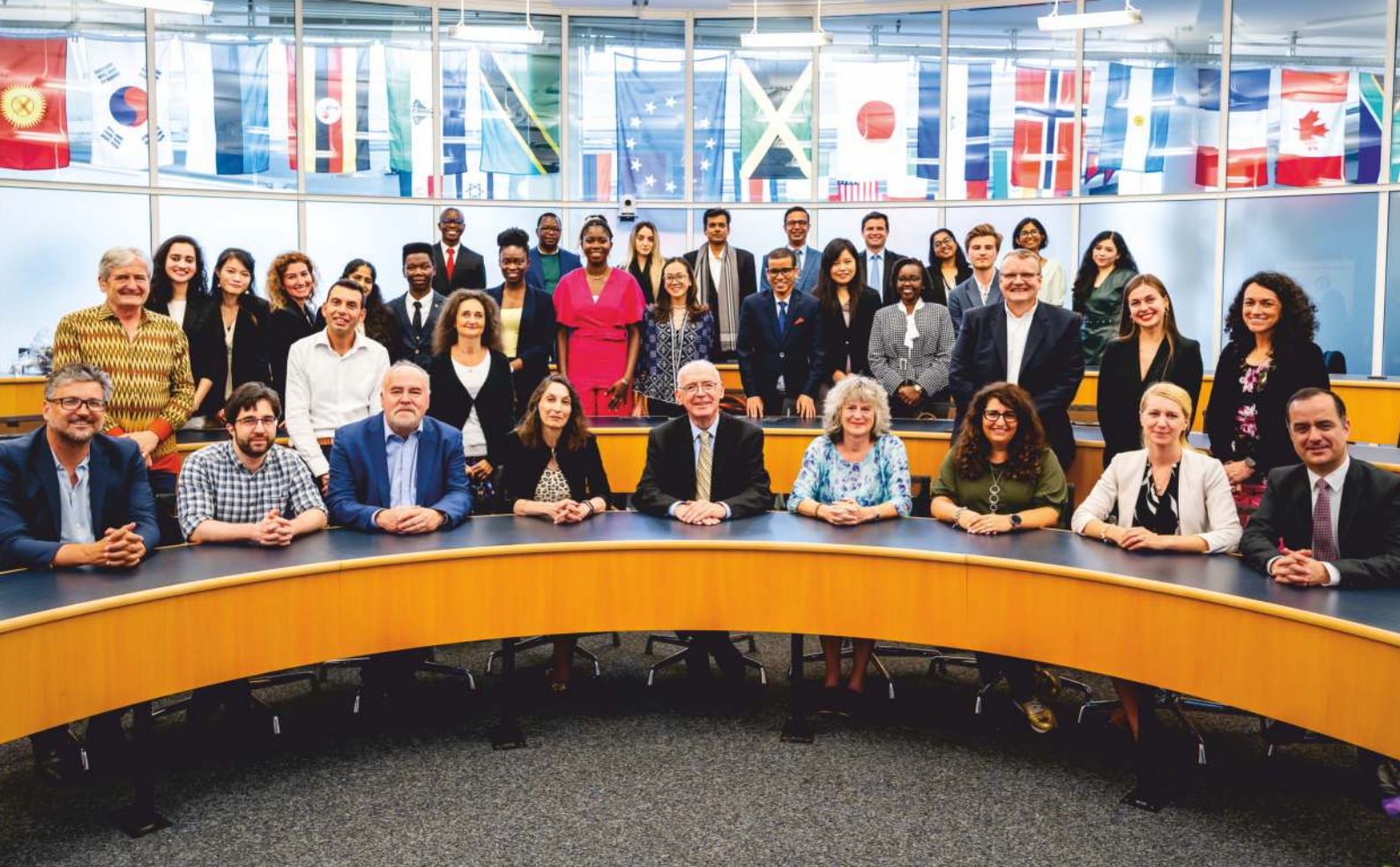
2021-2022 class picture (MILE and TRAIL+) with WTI staff members