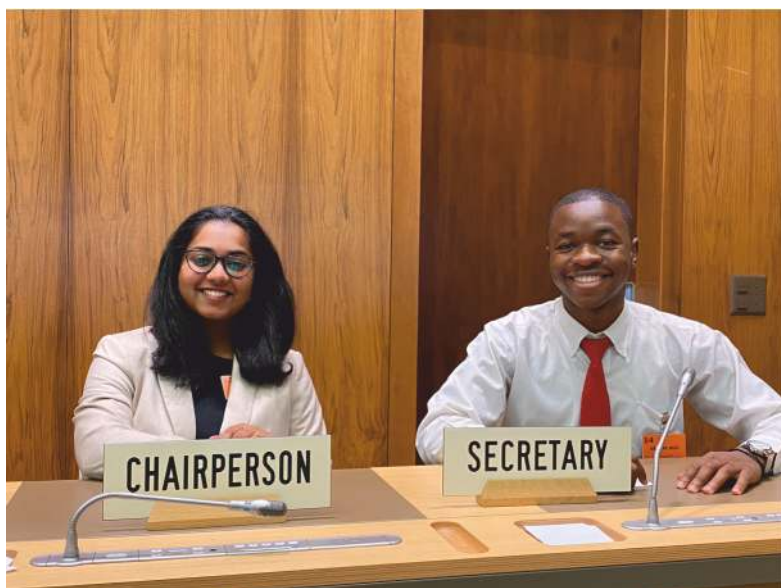
WTI students enjoying their annual WTO Moot Court simulation at the WTO building in Geneva