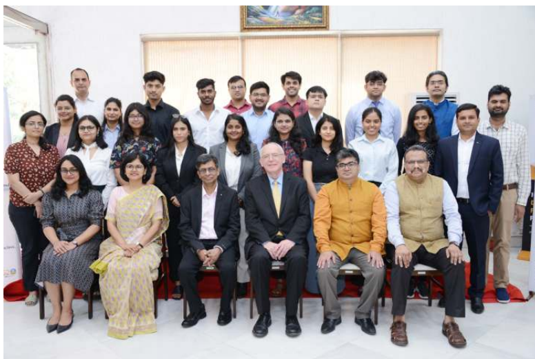
▲ Launch of the 9th edition of the WTI-CWS Joint Academy in New Delhi